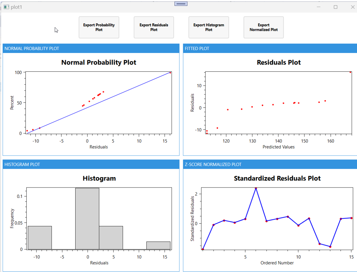
Fig1 – Residuals Plot